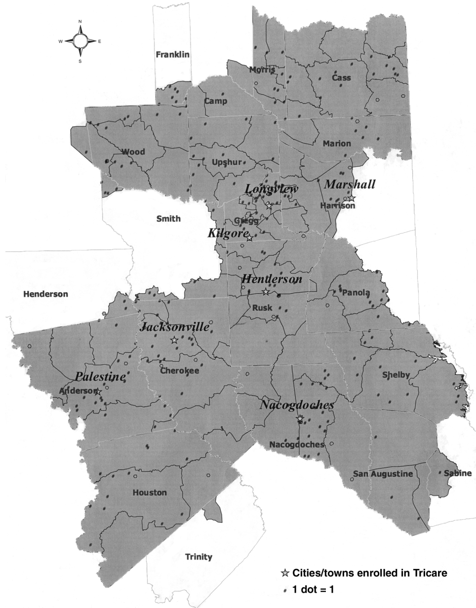
Figure G.1—TSSD Enrollees in and Around Cherokee County, Texas