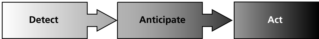
Figure S.2 Phases of Law Enforcement and Intelligence Activity to Counter Terrorist Group Efforts to Change and Adapt