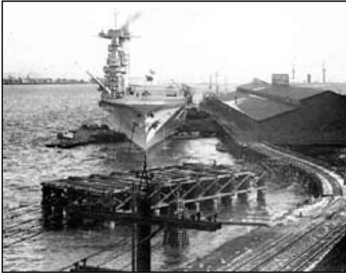
Figure 3.1 USS Lexington Supplying Power to Tacoma, Washington, 1930