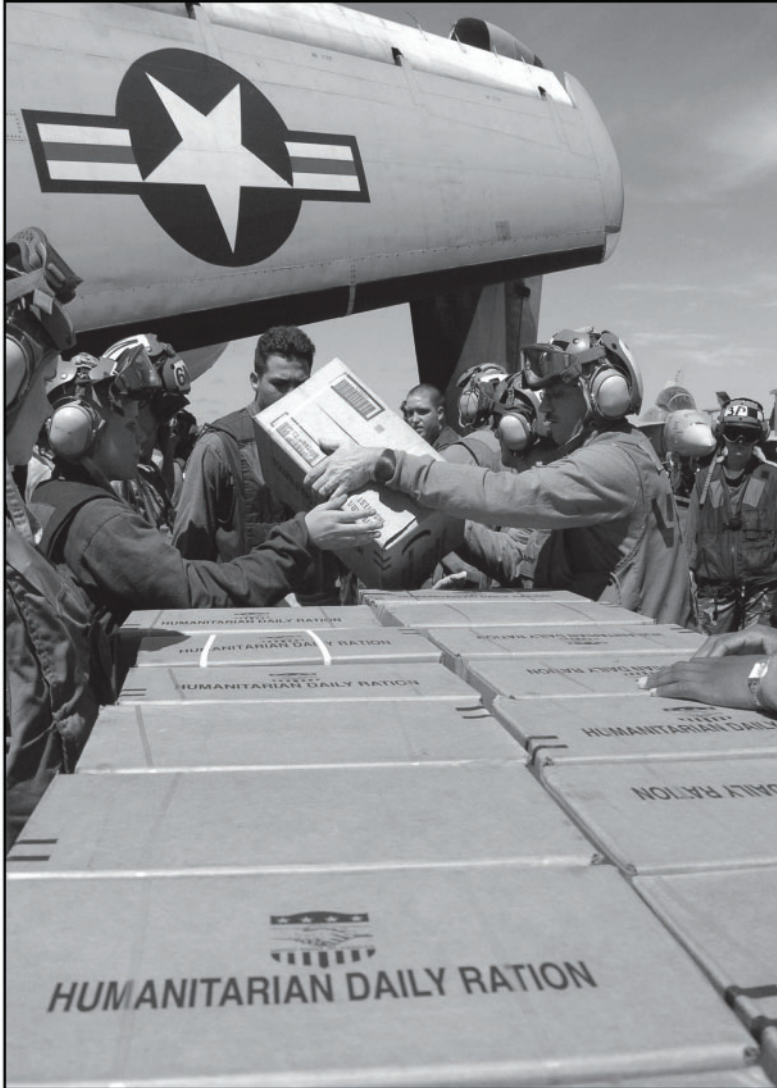
Figure 3.3 USS Abraham Lincoln Crew Members Readying Tsunami Relief Supplies, 2005