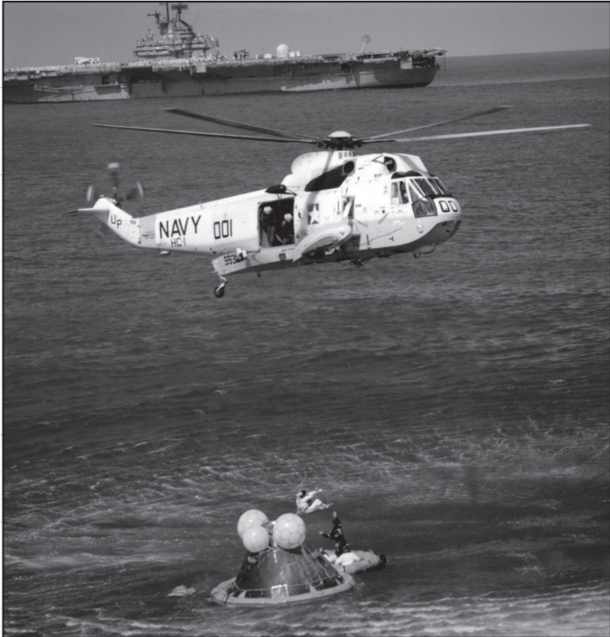
Figure 3.2 USS Ticonderoga Recovering Apollo 17 , 1972