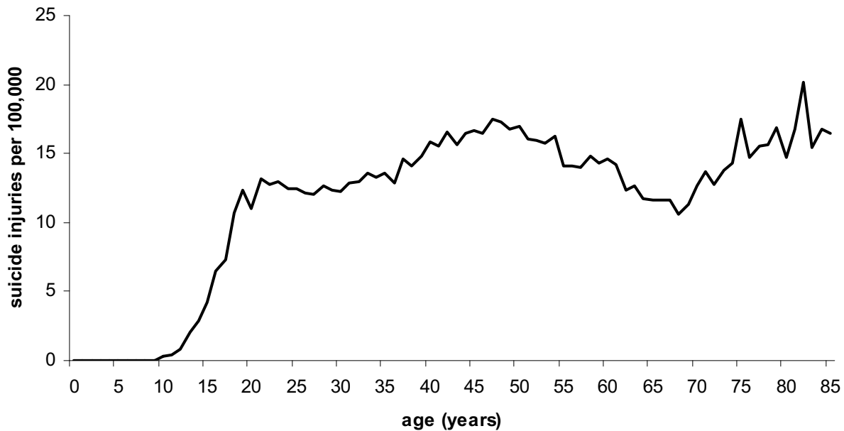
Figure 5.1 Suicide Injury Rates, United States (2004)

Centers for Disease Control and Prevention, National Center for Injury Prevention and Control. Web-based Injury Statistics Query and Reporting System (WISQARS)