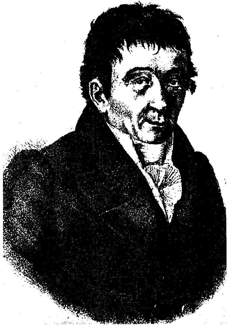
Fig.2—Ernst Florens Friedrich Chladni (1756 - 1827)