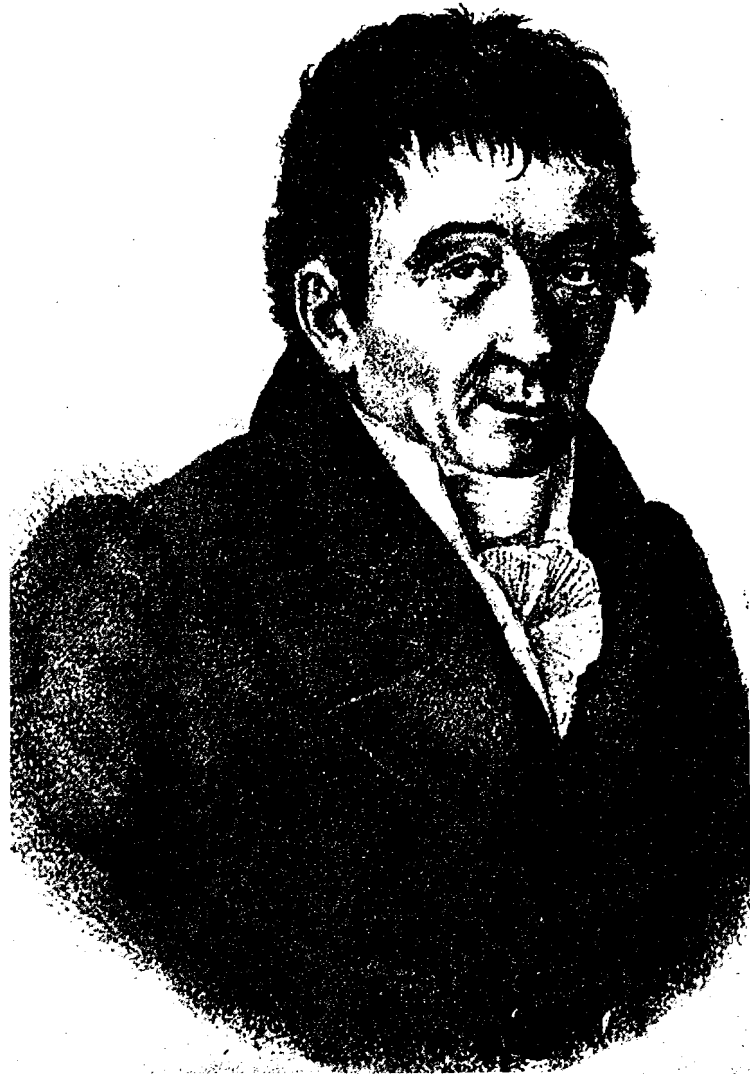
Fig.2—Ernst Florens Friedrich Chladni (1756 - 1827)