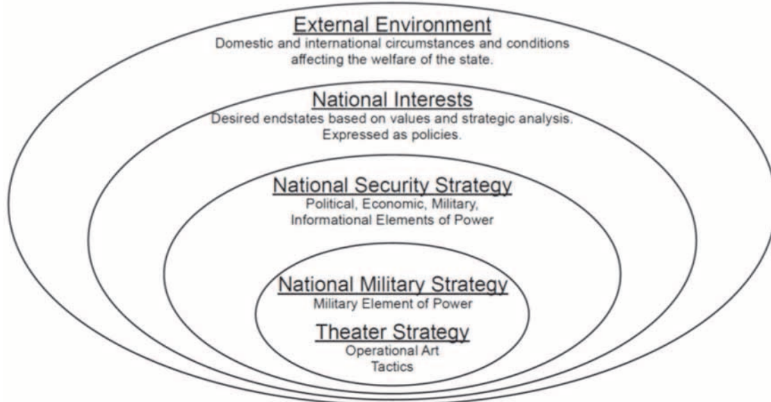
Figure 1. The Arthur Lykke Model “Comprehensiveness of Strategy”