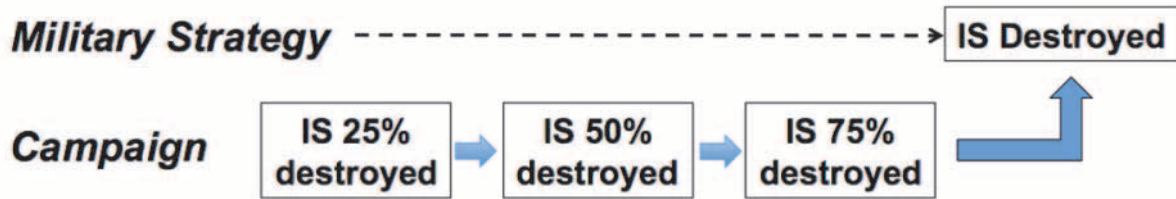
Figure 3. Notional counter-IS military campaign with operational objectives

Unfortunately, the simplicity of the military strategy in Figure 3 is illusory. While this does represent the basic approach to achieving military end states, no national security challenge offers such clear, linear solutions. In practice military campaigns are incredibly complex, often incorporating many lines of effort to achieve a range of intermediate objectives. Clausewitz argues that in real war, friction, uncertainty, and complexity make this kind of neat and concise ideal war planning unrealistic. Clausewitzian ideal war should not serve as a basis for planning in the real world. 24 This linear, self-contained approach is particularly inadequate to address the local, regional, and global complexities inherent in the counter-IS problem. Moreover, every military campaign must be nested within some kind of broader regional or global strategy, which in turn adds layers of resources but also layers of complexity. Devising any kind of military strategy is challenging, but devising a military strategy against a hybrid organization like IS is particularly so.